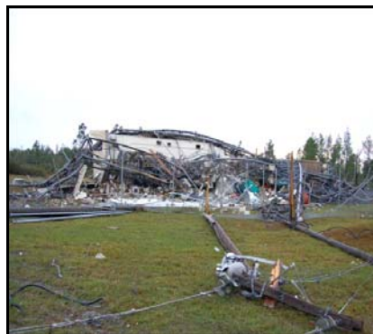
The Lake County Fire and Sheriff temporary transmitter site after the February 2 tornados.